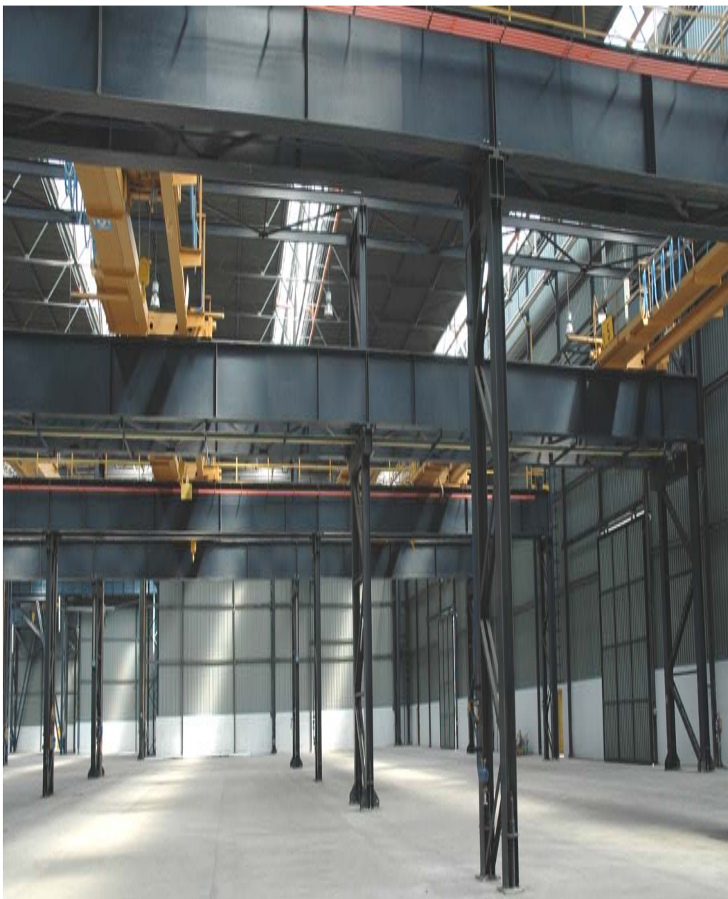
Corpo principale Interno, fili 1-2